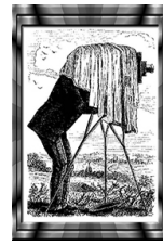
Our October Meeting