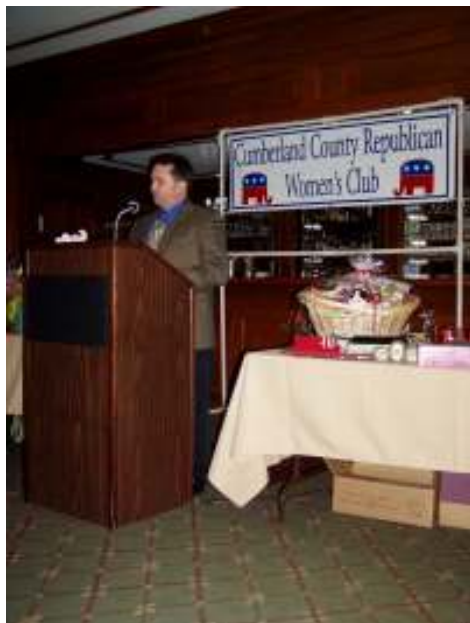
Sarah Palin book signing...