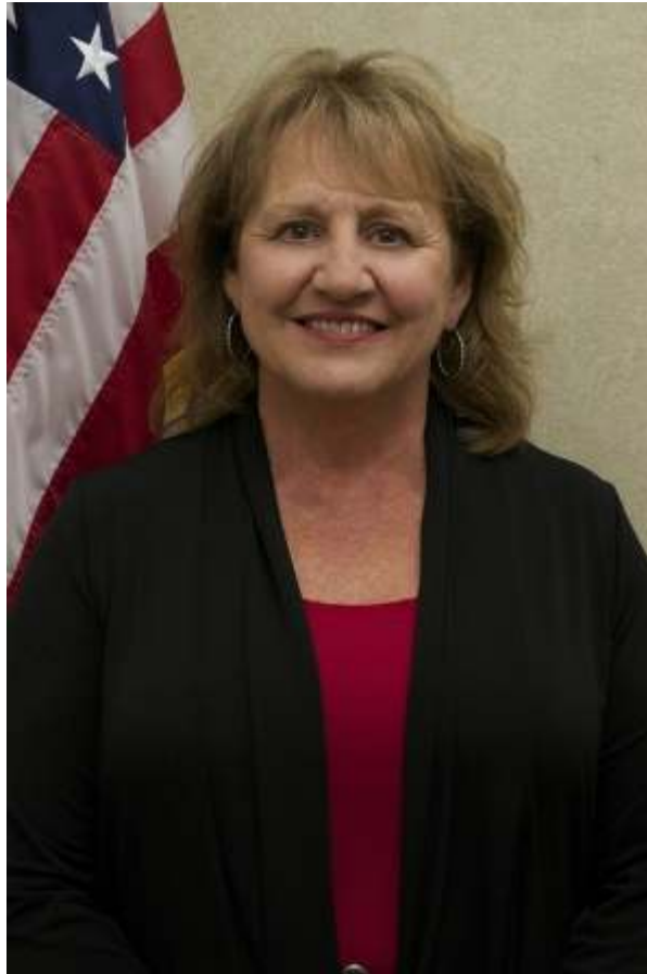
Jackie Warner, Mayor