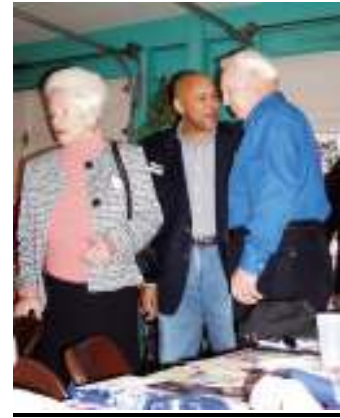
CCRWC at the Reagan Round Up