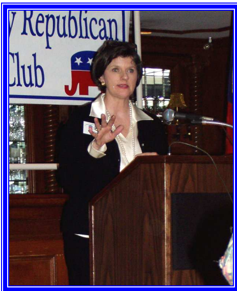
CCRWC member and NCFRW Lifetime Membership Chairman talks about the NCFRW Lifetime Membership Program.