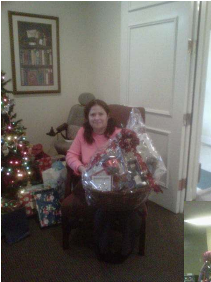
Christmas Basket won by the Fisher House.