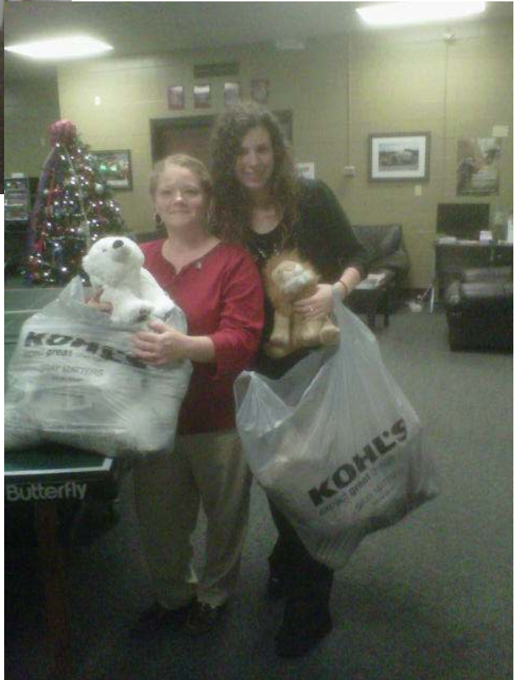
Stuffed Animals for the USO